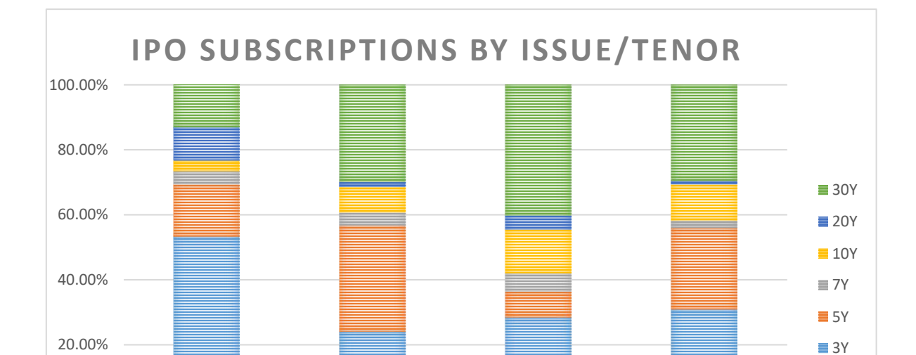
Figure 2: IPO subscriptions by issue and tenor

Figure 2 below illustrates benchmark offers' performance by tranche over the past four quarters.