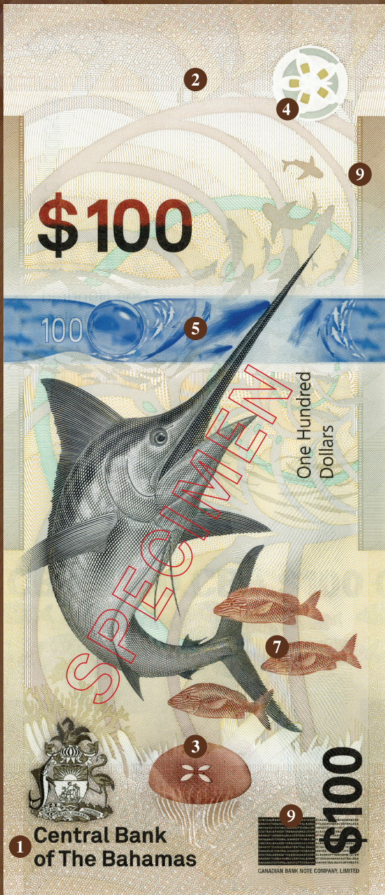
Back of note

To assist in authenticating your banknotes, download the CBB Banknote MAP using the QR codes below: