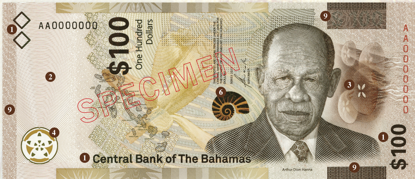
Front of note

A new $100 banknote has been introduced, and it is important that you know what to look for to verify whether a note is genuine or not.