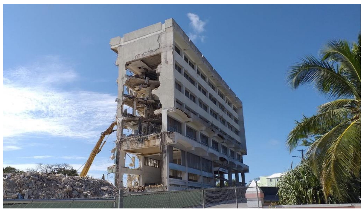
Post Office building during demolition (2021). View looking west from East Hill Street.