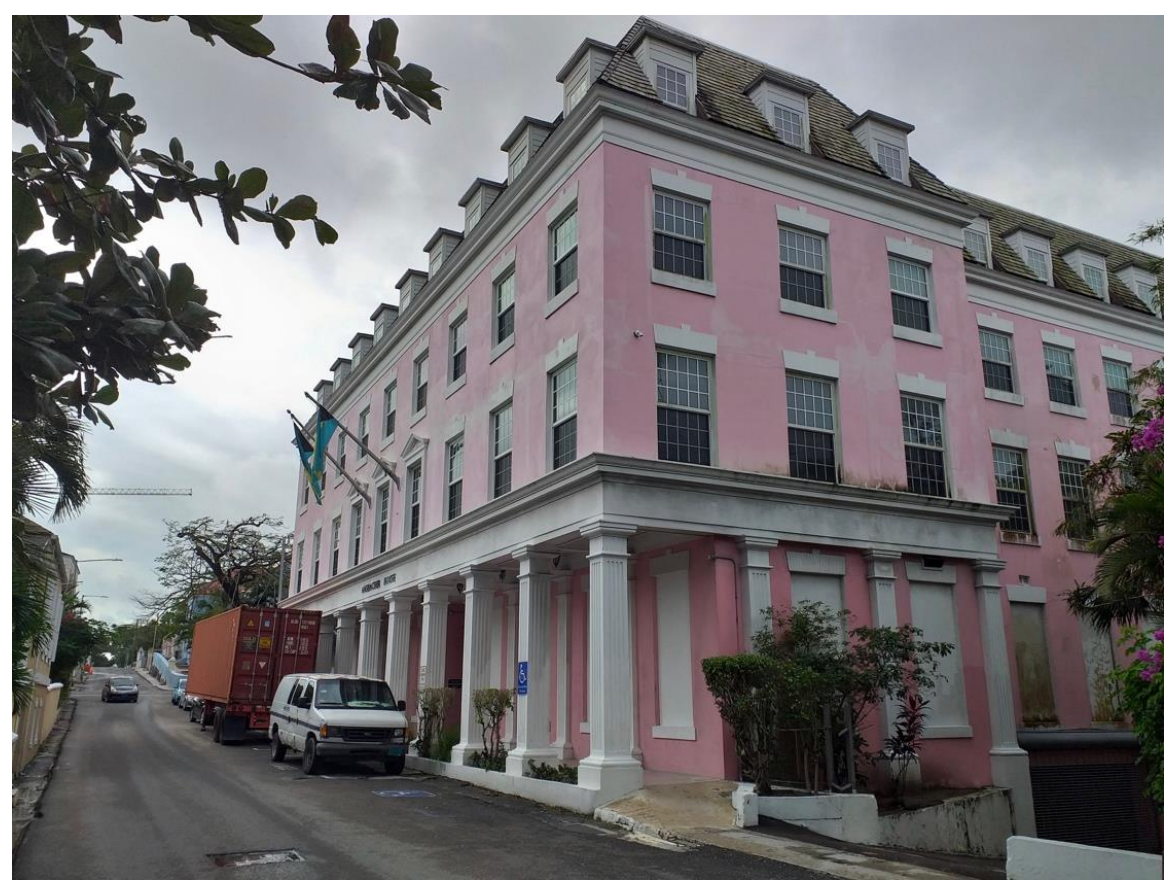
Ansbacher House building (2021). View from East Street.