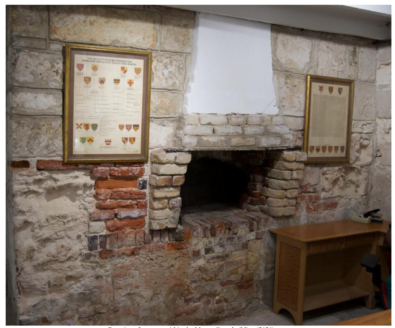
Remains of an oven within the Magna Carta building (2020).