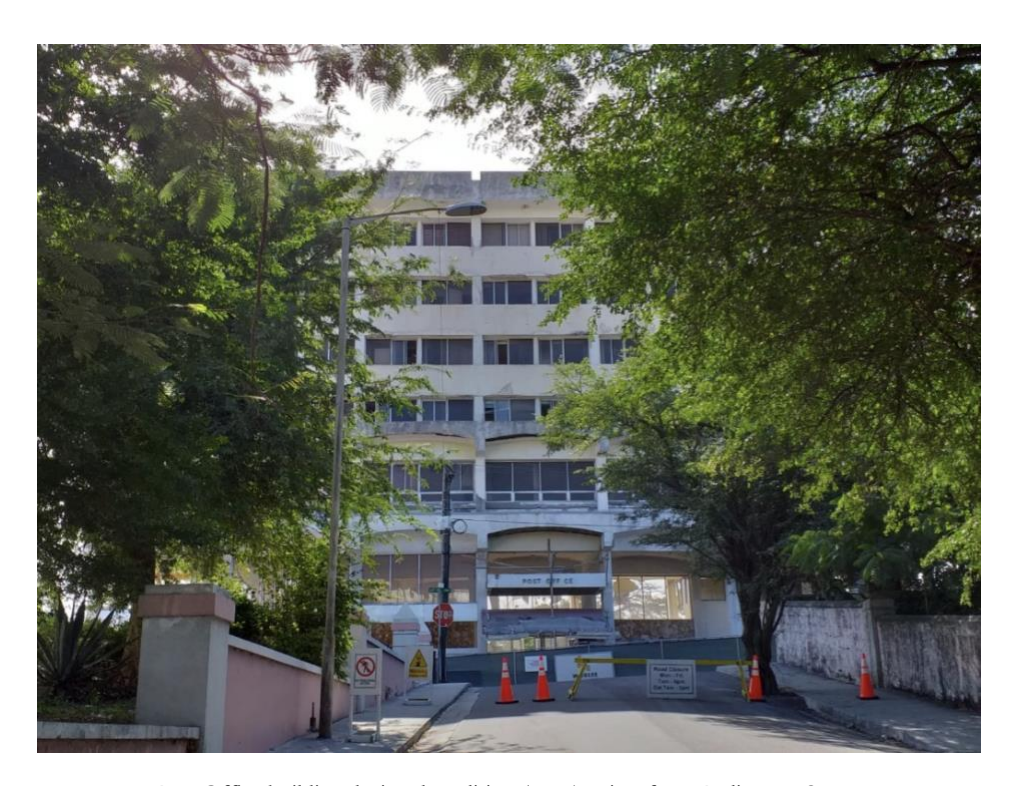
Post Office building during demolition (2021). View from Parliament Street.