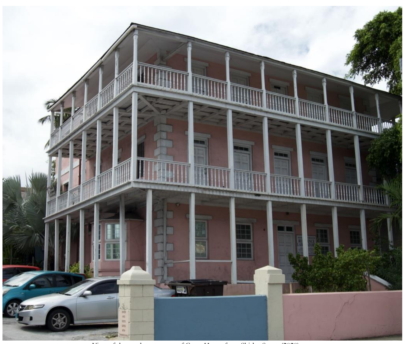
View of the northeast corner of Curry House from Shirley Street (2020).