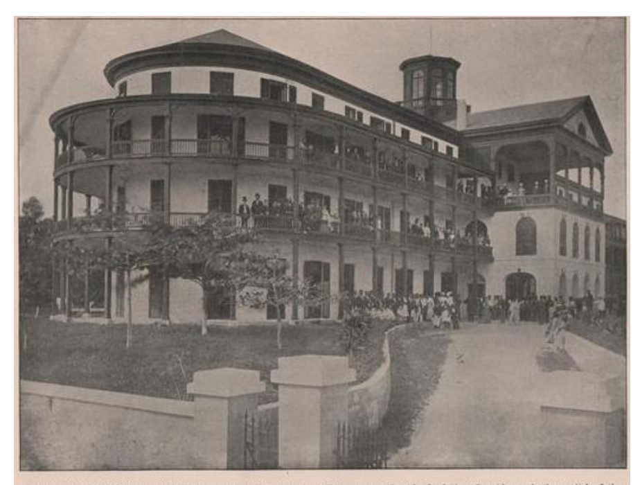
THE ROYAL VICTORIA HOTEL, NASSAU, NEW PROVIDENCE—Nassau, upon the island of New Providence, is the capital of the Bahama group. It is a colony of Great Britain. The home Government built many years ago the substantial Royal Victoria Hotel as a santarium. It is beautifully located upon the rising ground behind the white and red houses of the town, which are embowered in a wealth of tropical foliage. From its plazzas a fart-reaching view embraces the harbor, Hog Island opposite, and the surf which beats upon the coral reefs beyond. Fort Fincastle and Fort Charlotte are near by, and the fine roads, excursions by water to the sea-gardens and coral reefs, are greatly enjoyed by the large number of Americans who resort to this lovely "Isle of Summer" each winter.