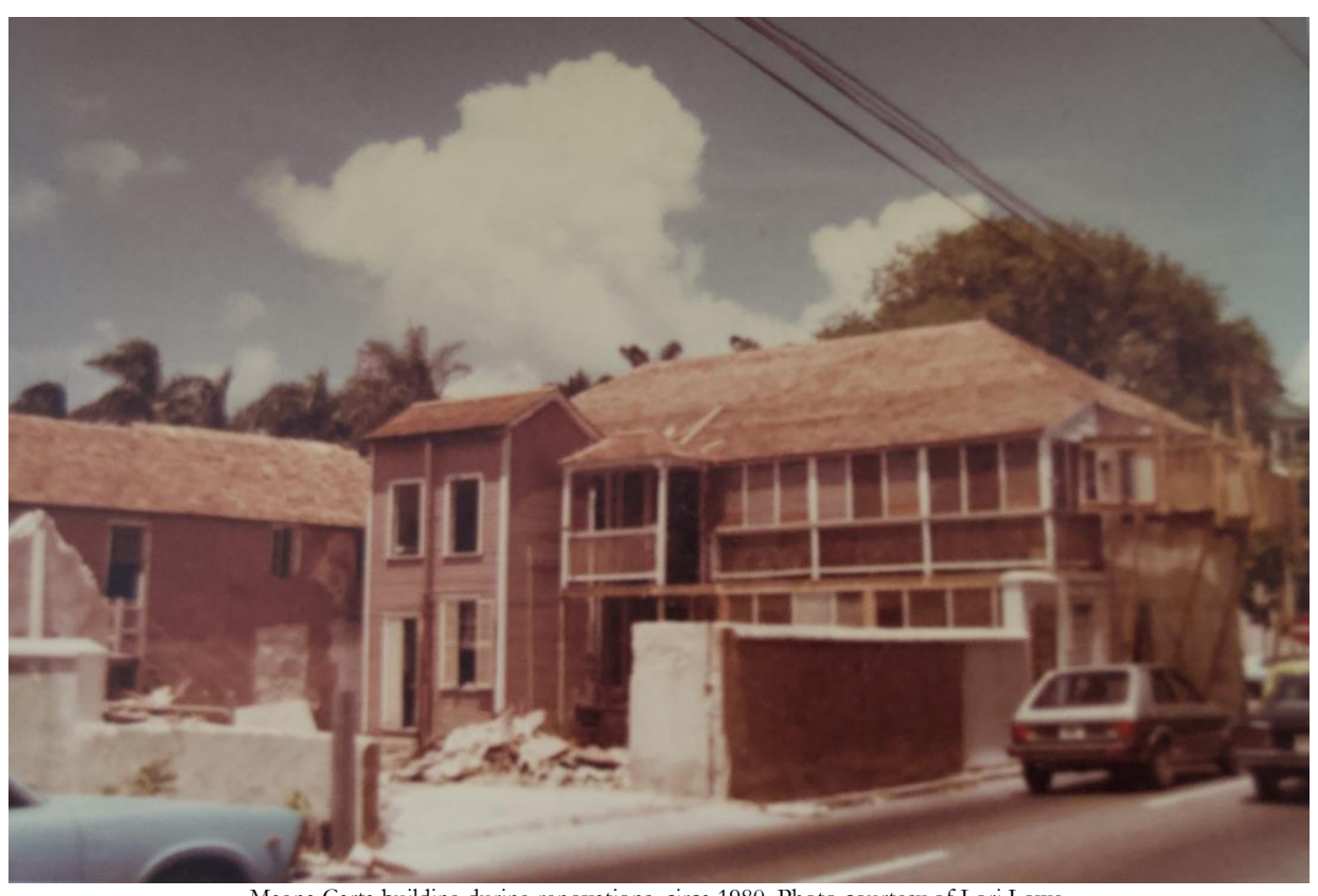
Magna Carta building during renovations, circa 1980.