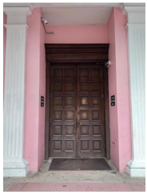
Ansbacher House door facing East Street (2021).