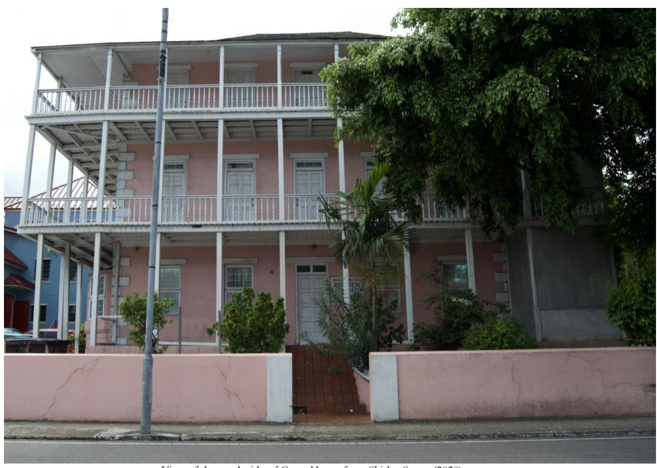
View of the north side of Curry House from Shirley Street (2020).