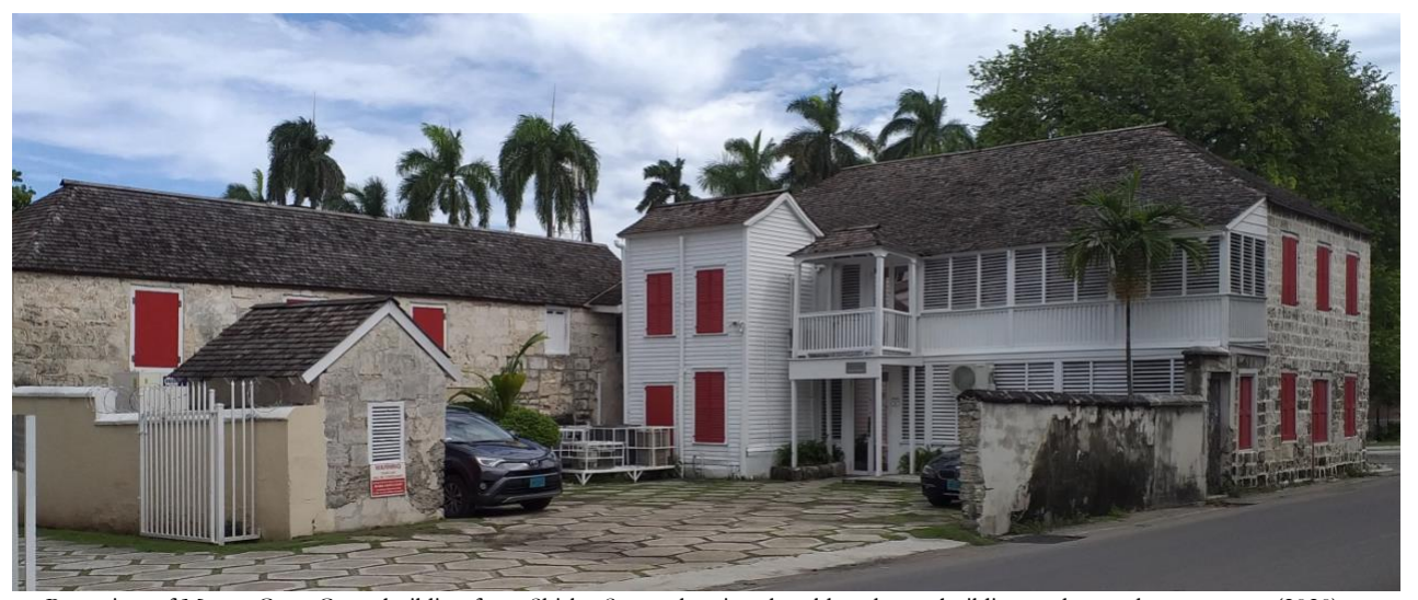
Rear view of Magna Carta Court building from Shirley Street showing the old outhouse building at the northwest corner (2020).

The building known as Magna Carta Court is located at the north west corner of Shirley and Parliament Streets. The building dates to the 1780s and is constructed of cut quarry stone and wood. It is outstanding as it is one of the few exposed-stone buildings in Nassau. The street facades are not decorated, the roof is a simple hip, and the windows have flat arches over them with hinged colonial-style shutters at their sides. The shutters are painted bright red and provide an artful contrast to the uncolored stone building. A wall of wood louvers is located at the rear of the building rather than the street side, in reverse to the typical arrangement.