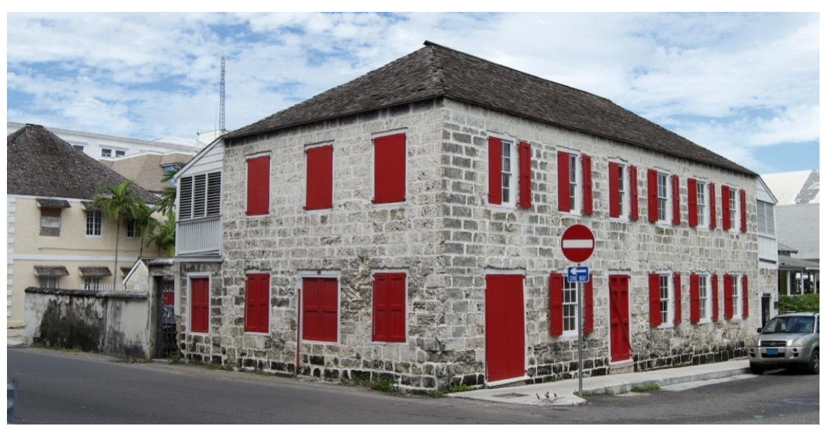
View of south and eastern sides of Magna Carta building (2020).