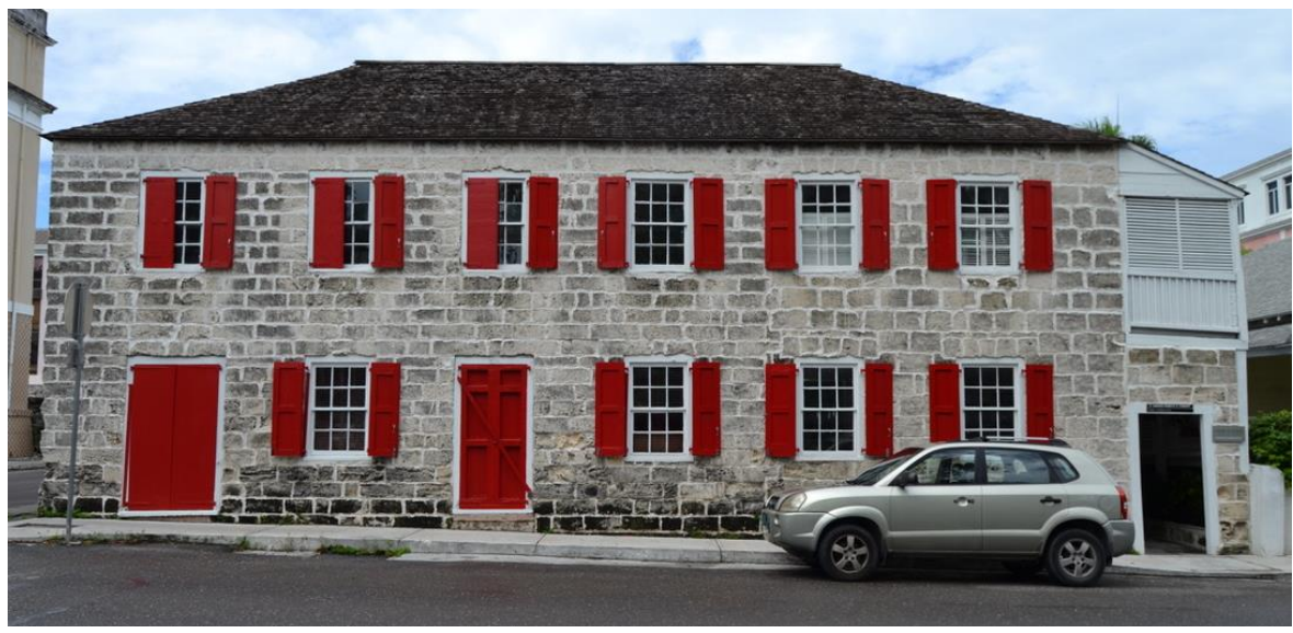
View of Magna Carta building from Parliament Street (2020).