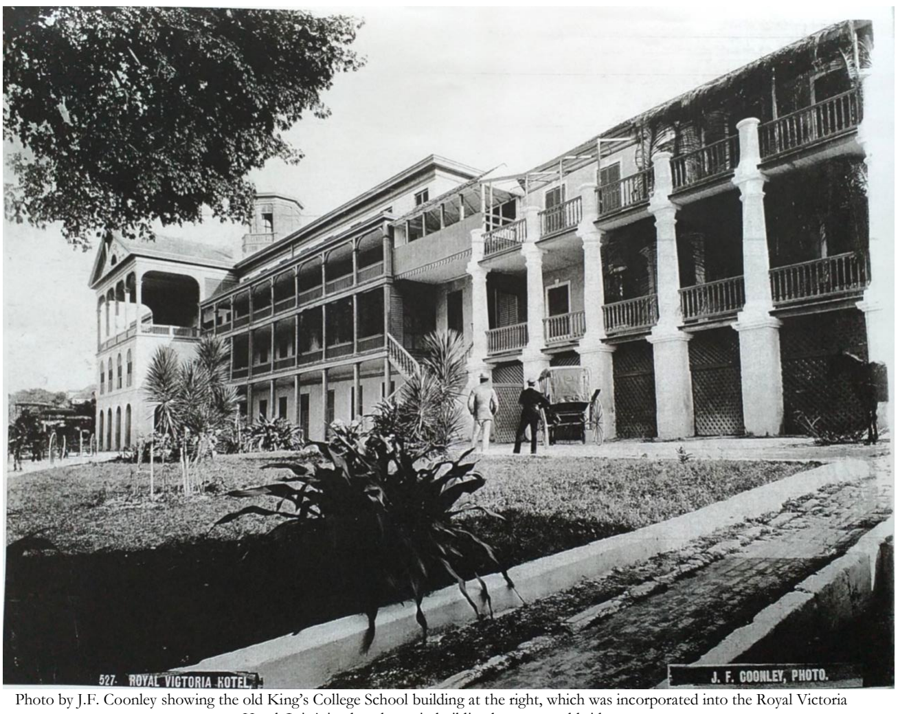
Hotel. It is joined to the main building by a covered bridge.