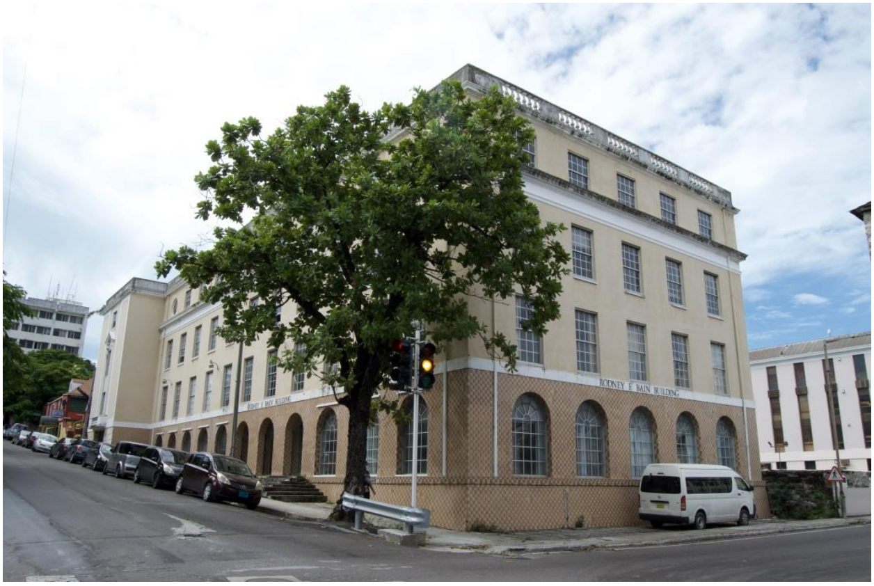
View of Rodney E. Bain building from Shirley Street (2020)