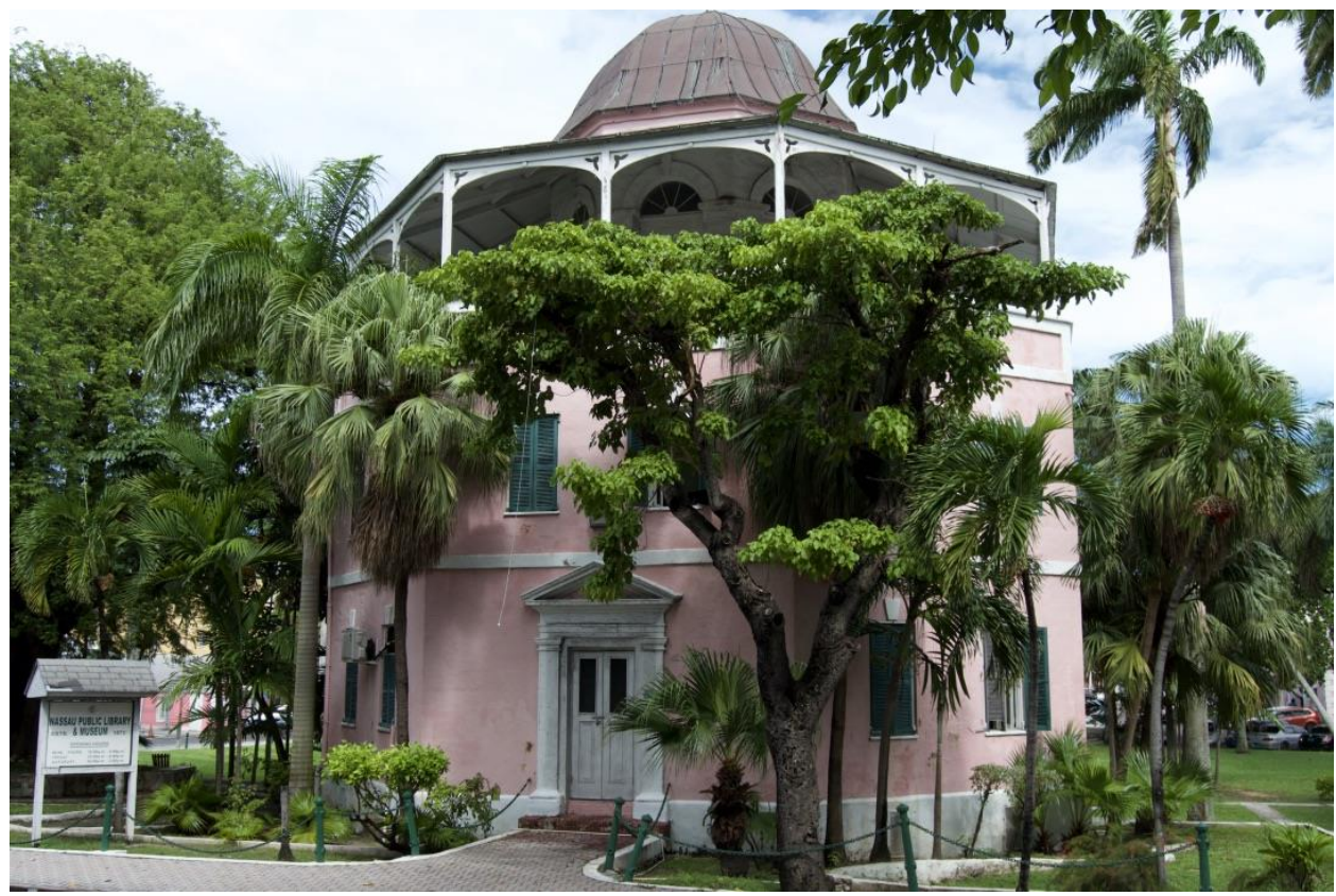
The Nassau Public Library and Museum (2020).

The Nassau Public Library and Museum is a three-story, stone octagonal building, painted pink, located on Shirley Street directly opposite the site of the Royal Victoria Hotel. The building was previously a prison constructed between 1797 and 1799 by Loyalist Joseph Eve. The octagonal design was believed to better withstand harsh weather and promote air flow. The first and second floors open into vaulted areas. The vaulted spaces, originally prison cells, now house books and serve as reading nooks. The third floor is encompassed by an open gallery. From the third-floor gallery, a bell was rung to call members of the House of Assembly to meetings.