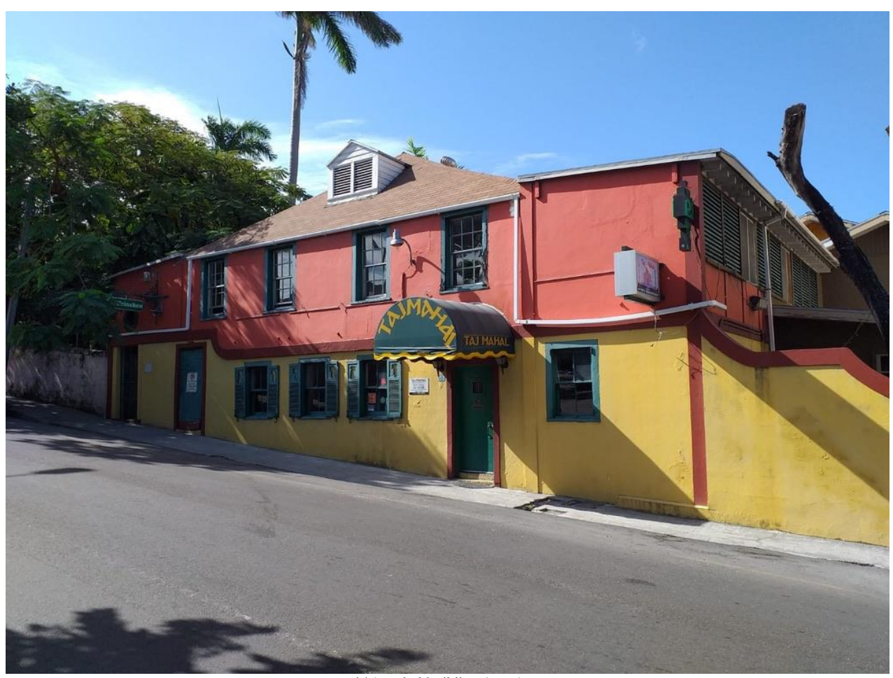
Taj Mahal building (2021).