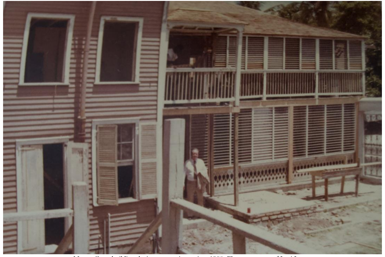
Magna Carta building during renovations, circa 1980.