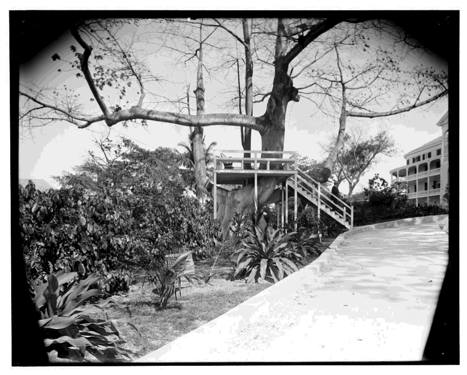
Grounds of the Royal Victoria Hotel, 1895.