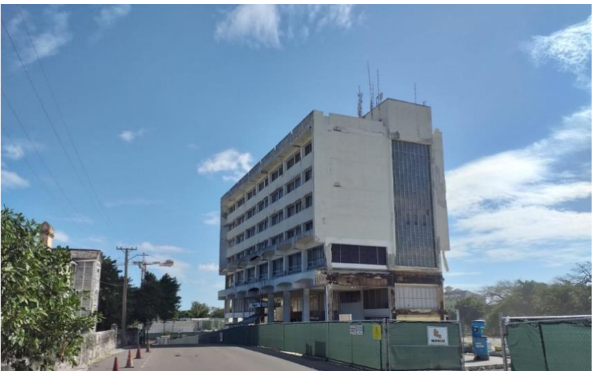
Post Office building during demolition (2021). View looking east from East Hill Street.

The General Post Office, located on East Hill Street, was constructed in 1970 at a cost of $3 million.<sup>74</sup> The building was designed by Milton Weis and Associates of Nassau. The post office was designed for 4,000 postal boxes with allowances for expansion to 7,500. There would be a moving conveyor belt to take mail and packages to sorting rooms and generous parking.