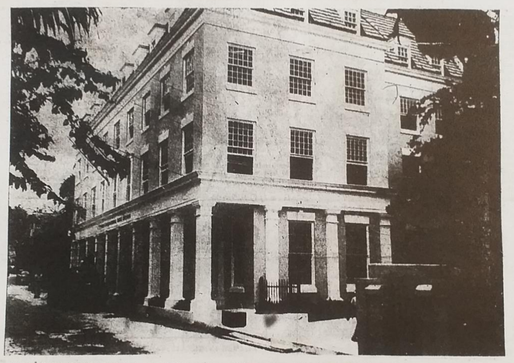
EAST STREET ENTRANCE to the new BITCO Building, and the entrance to the basement parking garage on the extreme right.