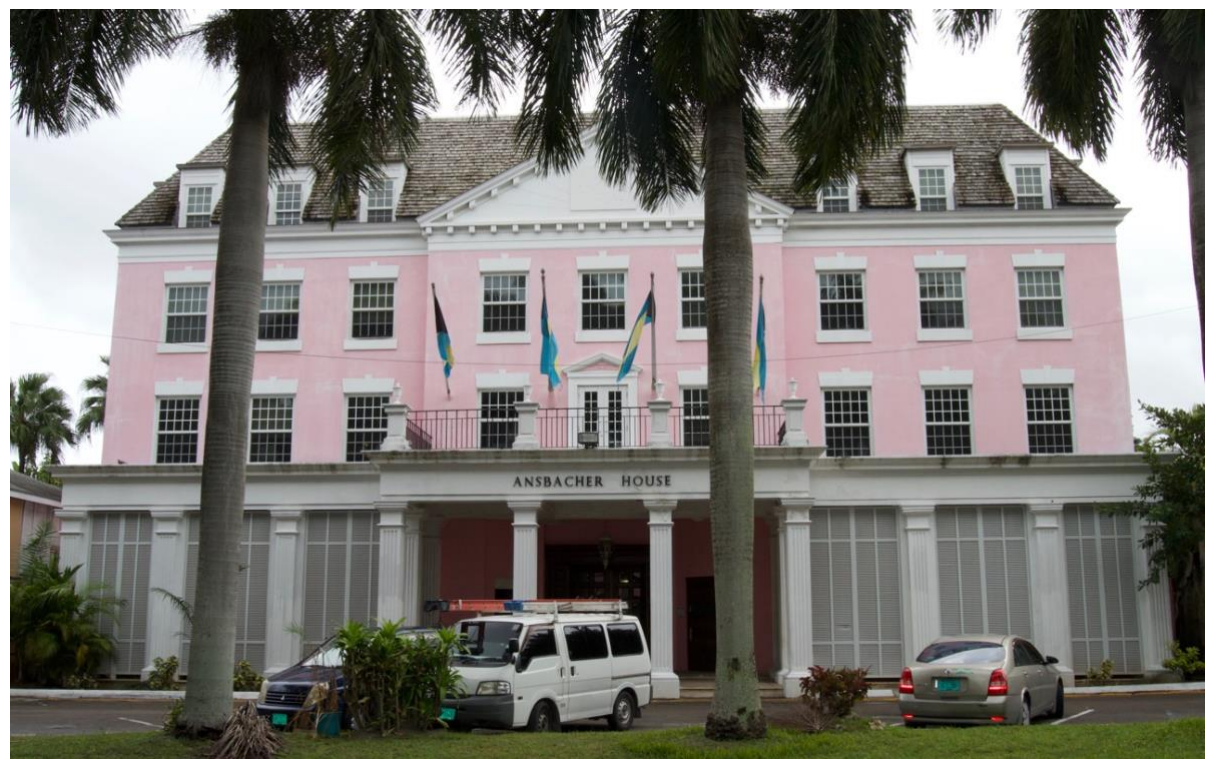
Ansbacher House building (2021). View from Bank Lane.

The Ansbacher House building is located between East Street and Bank Lane, fronting the Public Square. The building was originally the Bahamas International Trust Company (BITCO) building, which was built between 1961 and 1962, and opened on April 10, 1962. BITCO had been established in Nassau in January 1957. In five years, the company had grown from a small staff of two to a large organization with over 30 staff members.