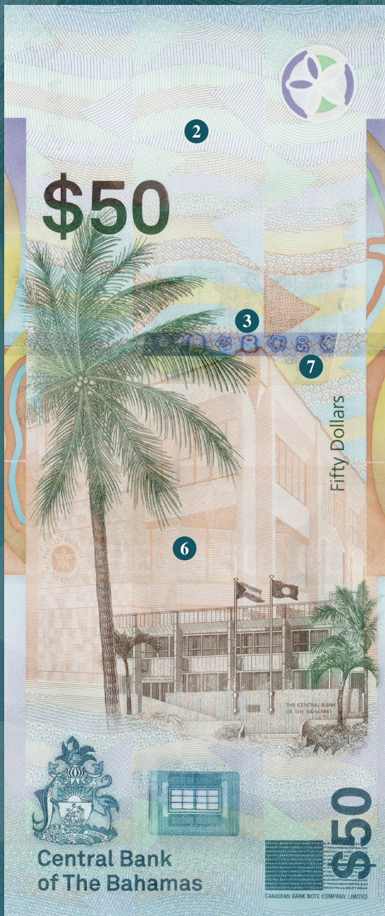
Back of note