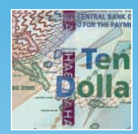
2. Colour shifting thread with text