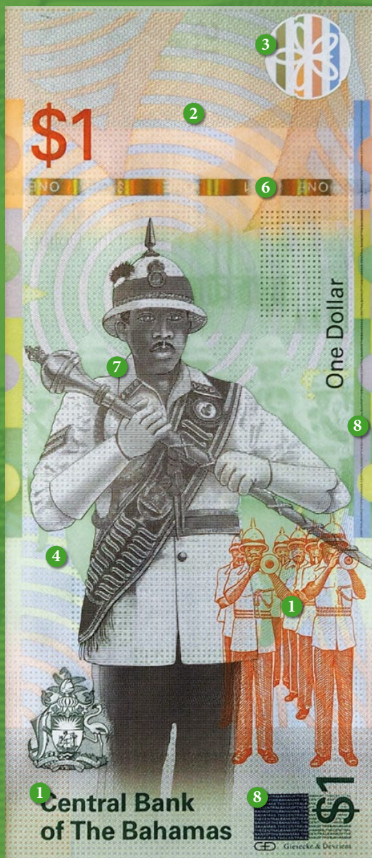
Back of note