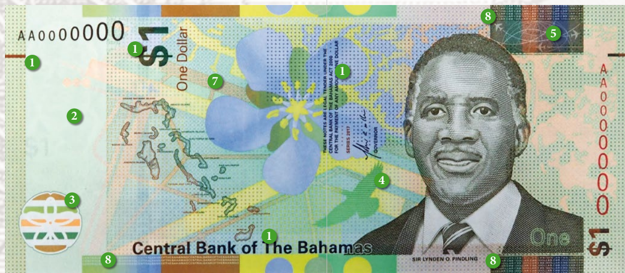
Front of note

A new $1 banknote has been introduced and it is important that you know what to look for to check that a note is real