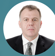
Serhan Cevik IMF