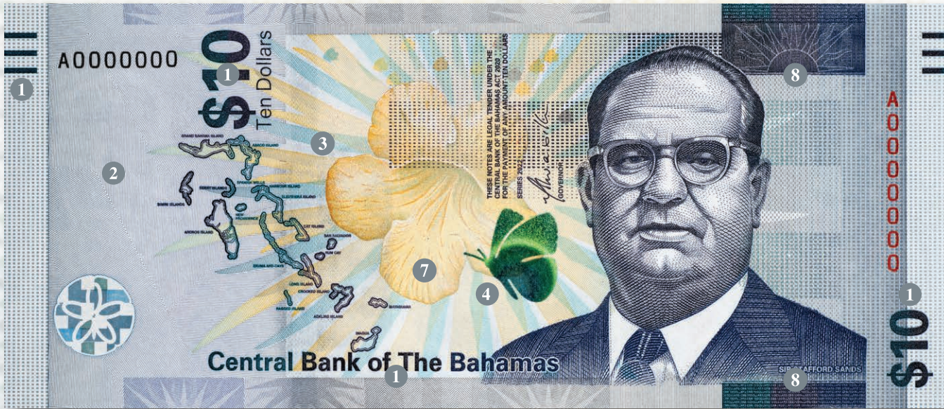
Front of note

A new $10 banknote has been introduced and it is important that you know what to look for to verify whether a note is genuine or not.