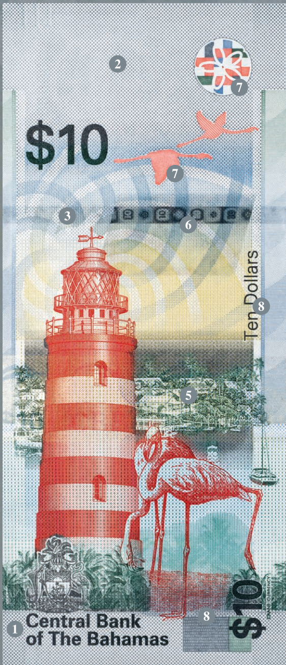
Back of note

To assist in authenticating your banknotes, download the CBB Banknote MAP using the QR codes below: