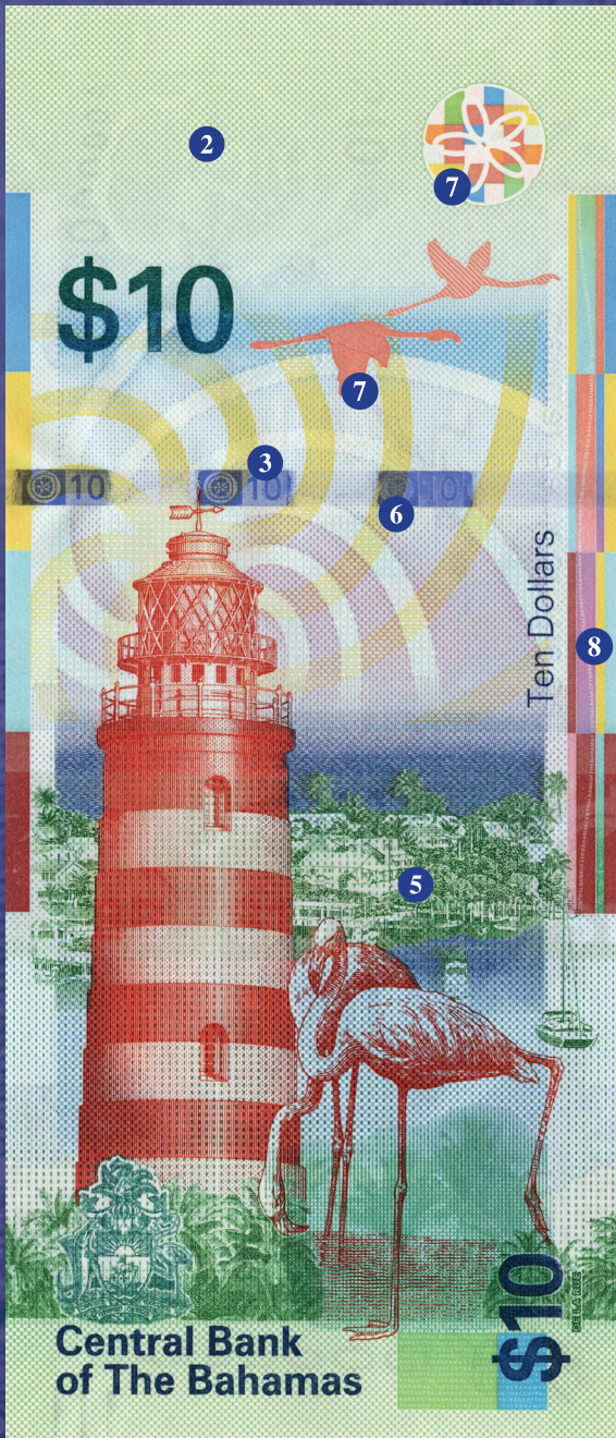
Back of note