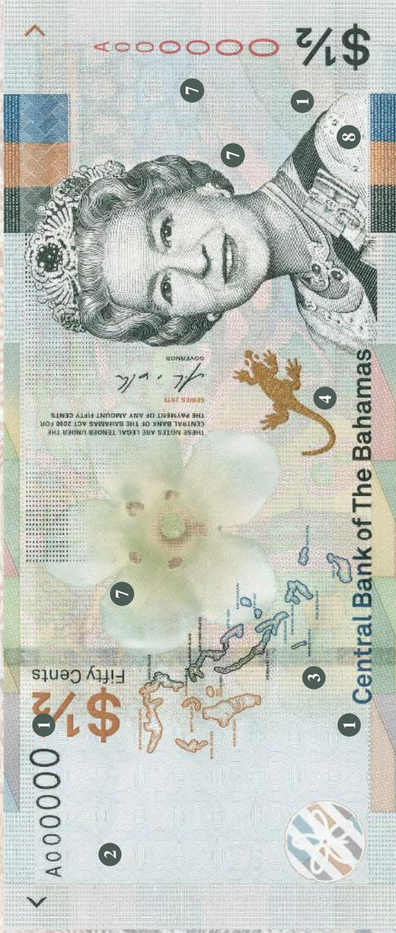
Front of note

A new $ \frac{1}{2} banknote has been introduced and it is important that you know what to look for to verify whether a note is genuine or not.