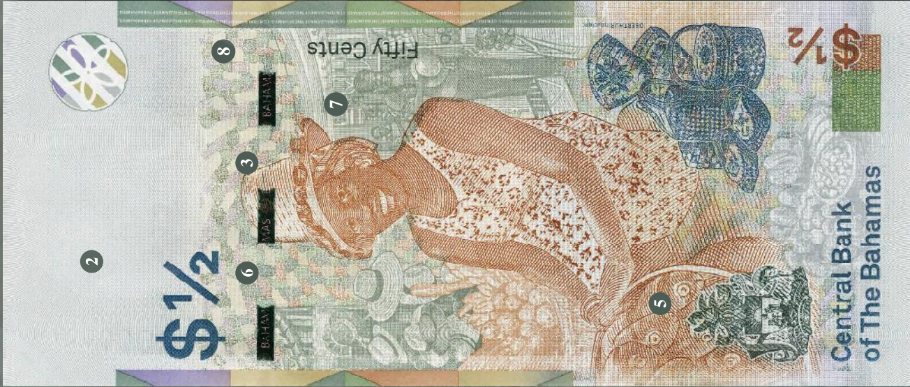
Back of note